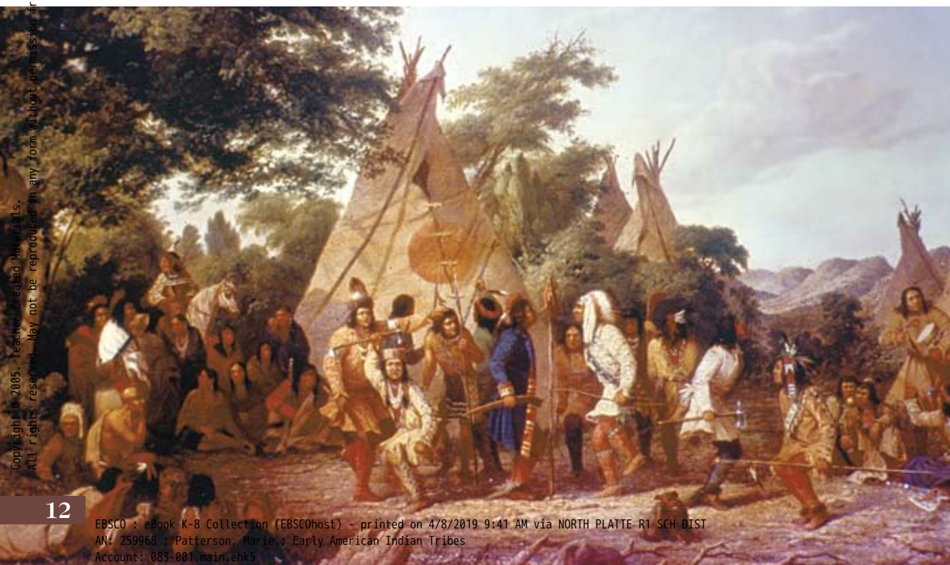
▼ Dog Dance ceremony of a Plains Indian tribe

These tribes believed that the whole family should raise the children. This meant parents, grandparents, aunts, and uncles all helped with the children. The families often adopted children who were orphans.